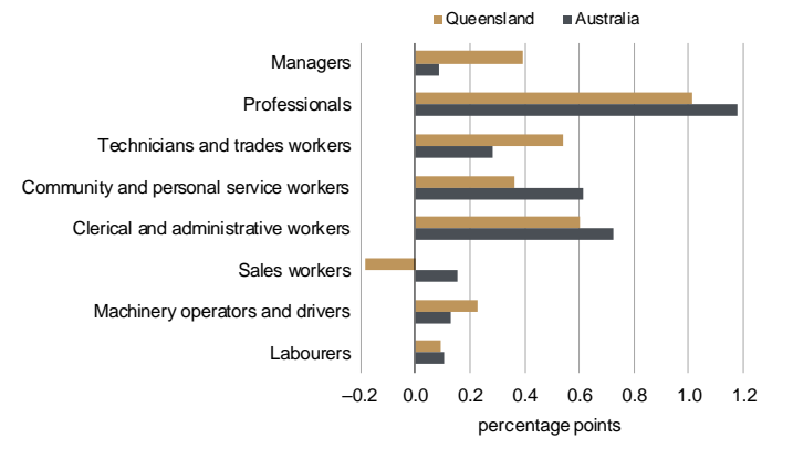
Figure 2 Percentage of employed persons by occupation of employment, March quarter 2024