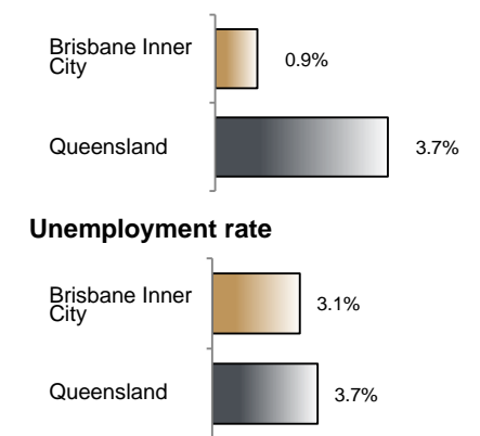
Figure 1 Annual change in employment, Brisbane Inner City SA4