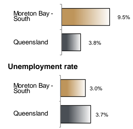
Figure 1 Annual change in employment, Moreton Bay -South SA4