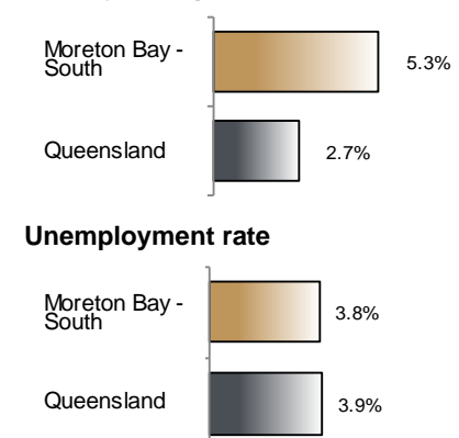
Figure 1 Annual change in employment, Moreton Bay -South SA4