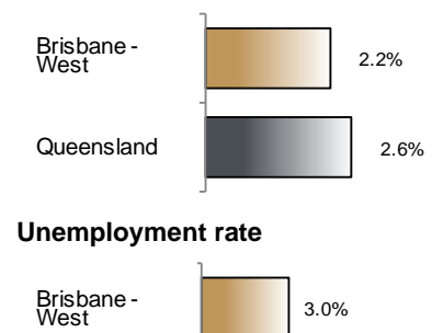
Figure 1 Annual change in employment, Brisbane - West SA4