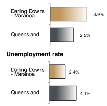
Figure 1 Annual change in employment, Darling Downs -Maranoa SA4