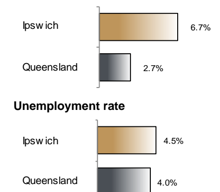
Figure 1 Annual change in employment, Ipswich SA4