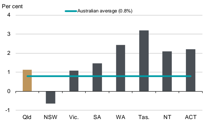
Figure 1 Monthly change in retail turnover Per cent _______Queensland ______Australia