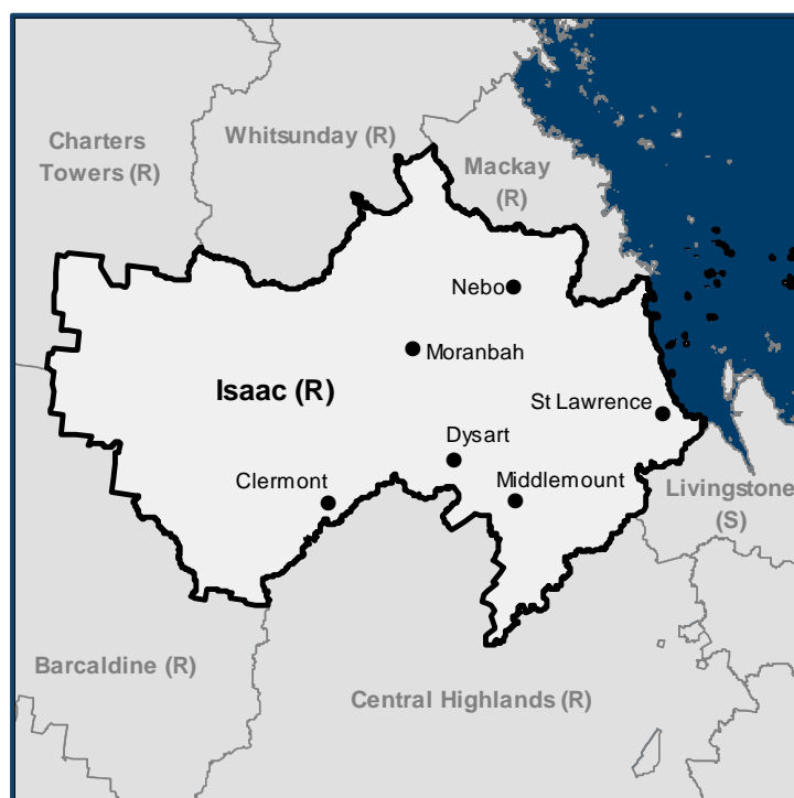
Table 1 Isaac (R) land use profile