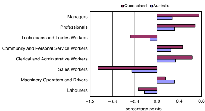
Figure 2: Proportion of employed persons by occupation of employment iii , June quarter 2012