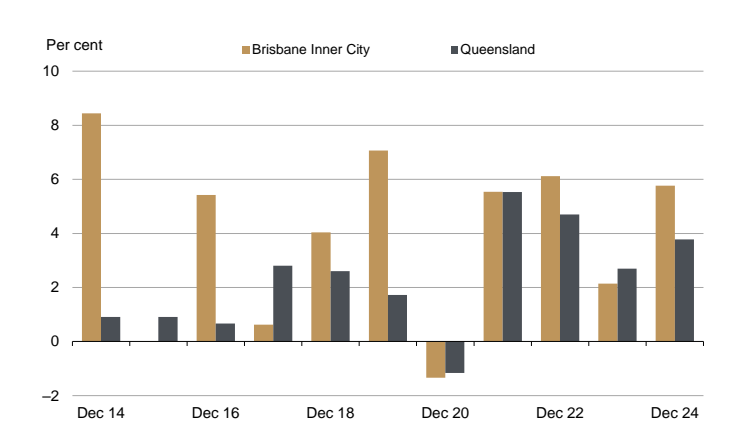
Figure 2 Unemployment rate by SA4, December 2024