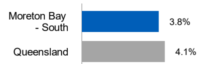
Figure 1 Unemployment rate, Moreton Bay - South SA4 and Queensland